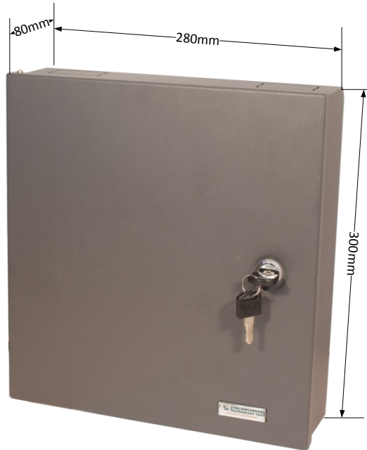
Figure 1. Product Dimension