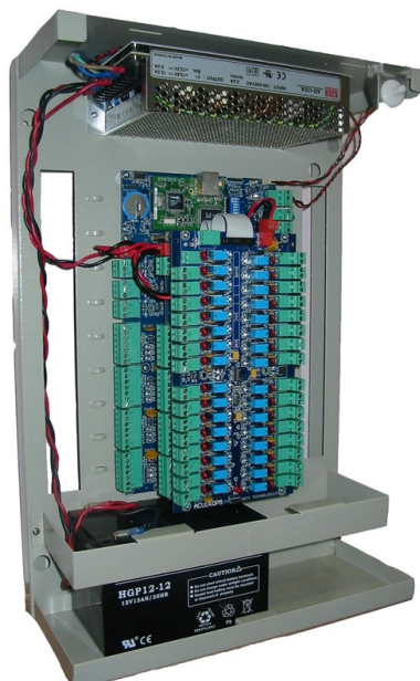
Figure 2. ACU1000 Assembly Complete with PCB, Power Supply and Back-up Battery

The ACU1000 assembly is housed in a metal enclosure. It consists of a power supply unit & a backup battery.